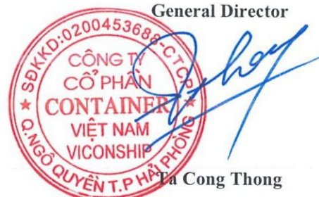
Ta Cong Thong