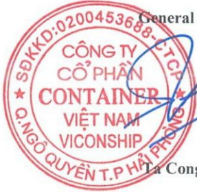
Ta Cong Thong