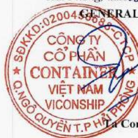
Ta Cong Thong