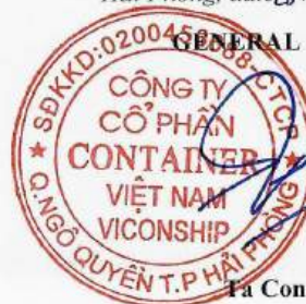
Ta Cong Thong