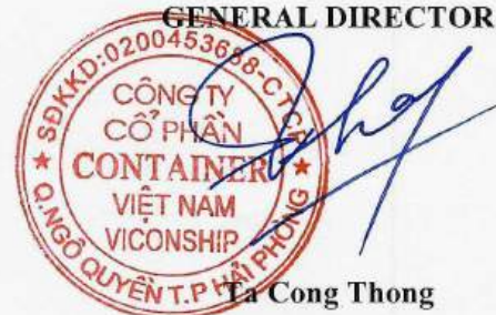
Ta Cong Thong